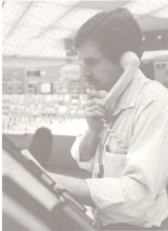
TMI-1 operator provides information to a plant worker.

Describing the job of a control room operator, a manager at TMI explained it