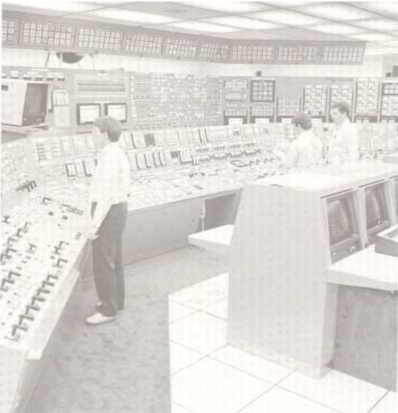
Operators train on the TMI-1 replica simulator.

Control room operators perform a vital role in the operation of a nuclear power plant. They constantly monitor and respond to plant needs from a highly sophisticated nerve center called a control room, which is connected - by miles of electrical cable and computers - to the heart of the plant, the reactor, and to other important parts of the powerstation. Together, this man/machine interface controls the plant.