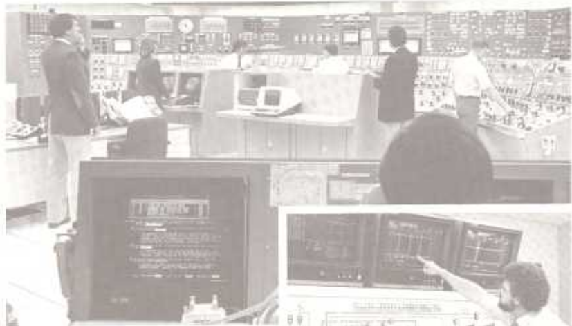
TMI-1 Replica Simulator.

that teach the specifics of the plant. Quizzes are conducted weekly. The classroom training provides the basic fundamentals required to be a control room operator.