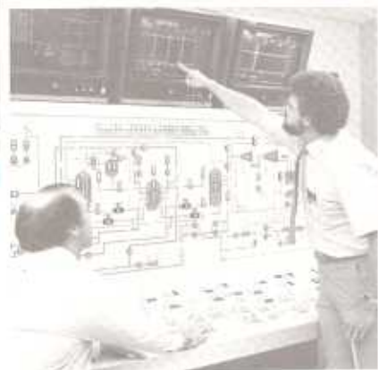
TMI-1 Basic Principles Training Simulator.

that teach the specifics of the plant. Quizzes are conducted weekly. The classroom training provides the basic fundamentals required to be a control room operator.