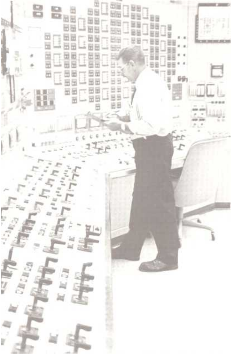
Oyster Creek Control Room Operator ensures plant is operating properly.