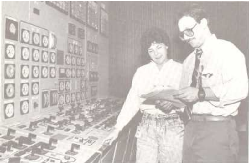
Oyster Creek operators review procedures in the control room.

The typical operator at GPU Nuclear is 36 years old, has worked for the company for over ten years, is married with two children and lives close to the plant. They are well-paid professionals who are dedicated to their jobs. They spend thousands of hours in training, including time on computerized replica simulators. Some have served in the nuclear Navy before joining GPU Nuclear, others, mostly homegrown talent, have progressed through the operations ranks to become control room operators.