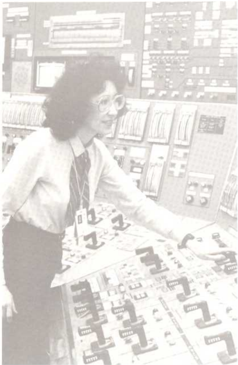
A TMI-1 Control Room Operator maneuvers one of the many switches in the plant's control room.