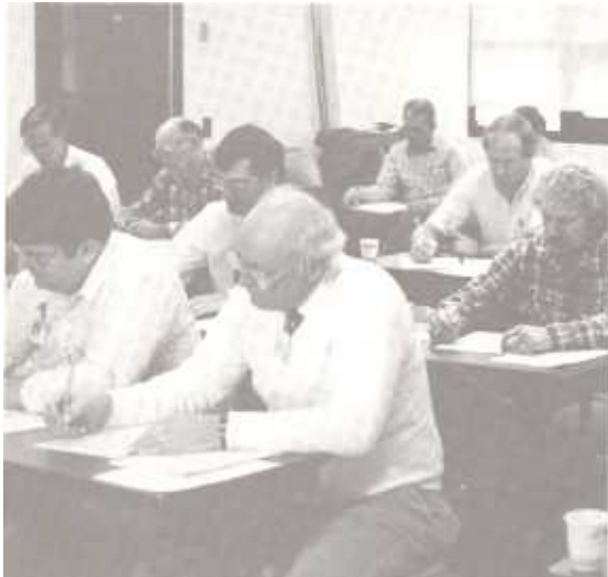
TMI employees concentrate on a written examination.

Control room operator trainees attend six months of classroom training, which includes courses in nuclear physics, radiological protection, chemistry, and reactor theory. They also take plant systems and procedure courses