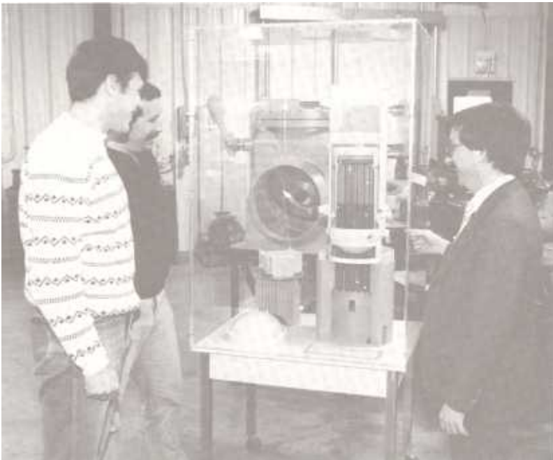
Oyster Creek operator trainees examine a training model with an instructor.

The NRC issues two types of licenses: a reactor operator's license and a senior reactor operator's license. The senior reactor operator examination includes additional areas such as emergency planning, technical specifications and administrative controls.